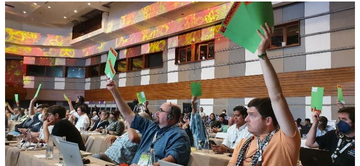
Voting session at the FSC General Assembly 2022

Preferred by Nature is actively engaged in the FSC system at both global and local levels.